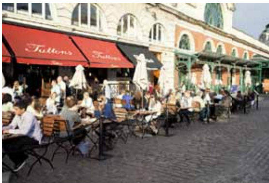
Covent Garden is a vibrant place with restaurants and shops, in the redeveloped market buildings, and is a very popular place for shopping and eating, near theatreland.

No trip to London would be complete without a pub crawl, so I suggest hitting these very colorful, historic Pubs: Ye Olde Mitre, Ye Olde