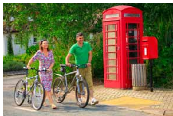
A couple walking with their bikes past a traditional red phone box, in Milton Keynes Village.

Covent Garden indoor market has a magnificent collection of fashionable boutiques and unique small shops. Foodies should head for the Borough's Market, a gourmet's delight, filled with hundreds of booths filled with exotic