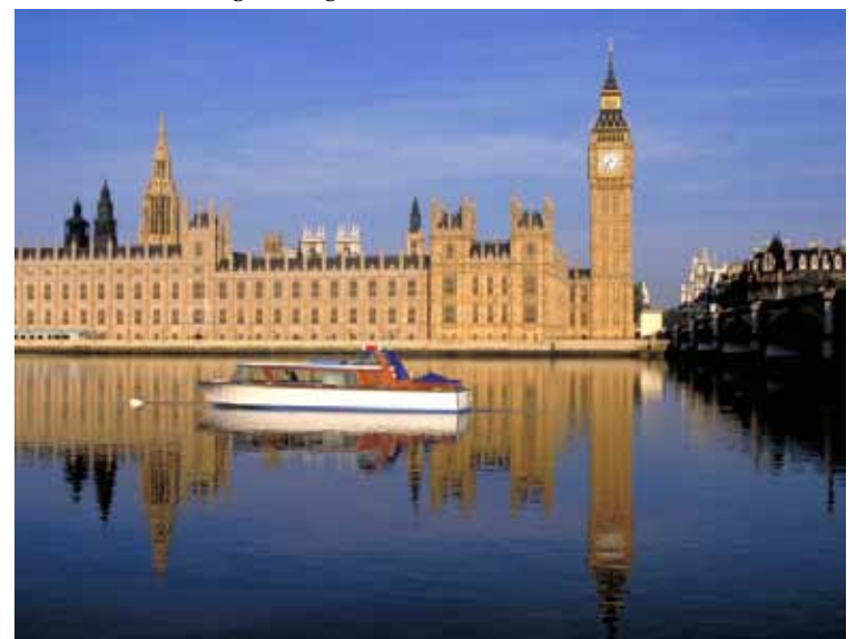
Big Ben and Hoses of Parliament, Westminster, London

For more information be sure to check out VisitLondon.com or LondonTourism.com and pick up one of the London Guide Books. VisitBritain.com