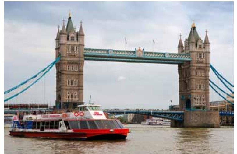
City Cruises Millennium at Tower Bridge

minute shopping, of course have one last High Tea and a spectacular dinner at one of the Guild Michelin restaurants I've suggested.