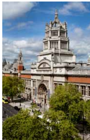
Victoria and Albert Museum