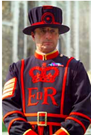
Yeoman Warder outside the Tower of London wearing the iconic blue undress uniform with royal livery introduced in 1858.

My grandfather was born in Minsk, then part of Russia. In 1886 the Cossacks ravaged my grandfather's village or "shtetl," and he quickly fled. After a harrowing journey, he somehow made it to London, where my father was born, in 1905. My family later emigrated to America, settling on the Lower East Side, in 1914. But no matter how many years passed, my father always carried "a small piece of London" inside of him. Of course I absorbed a bit of