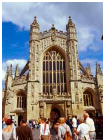
Tourists outside The West Front of Bath Abbey, Bath, Bath and North East Somerset, England