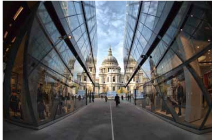
The view of the East End from No.1 New Change

The best way to see any city is to walk it. But I suggest that on your first day in London take a delightful double-decker "Hop-On, Hop-Off Bus Tour"