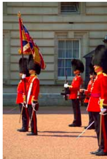
Ensign of the Coldstream Guards carrying the colours during The Changing of the Guard ceremony outside Buckingham Palace, Westminster, London, England.

If museums and history are your cup of tea, my three favorites are The British Museum, The Albert & Victoria Museum and The Natural History Museum. Each is very special, in many different ways. My favorite is the Albert and Victoria because it's much more than "just a museum." With an eclectic collection of thousands of unique items ranging from historical artifacts to high fashion and cutting-edge design throughout the ages, it captures everything that has impacted culture and civilization for centuries, right up to the present.