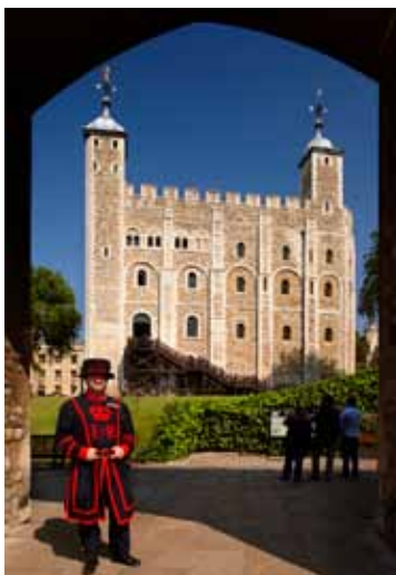
The Tower of London is a historic royal palace, former prison and fortress and national landmark on the banks of the River Thames in London. The White tower. UNESCO world heritage site. A Beefeater or Yeoman of the Guard, a military guard in traditional uniform

By the time you leave London, you might subliminally pick up a slight British accent. It won't last very long, but it's sure to impress your kids. On your last day, you might want to go back to place you loved the most, do some last