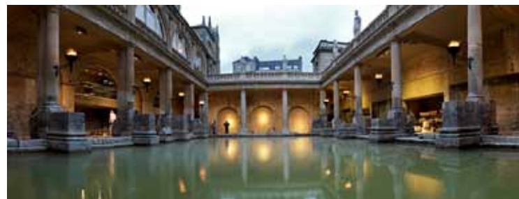
Roman Baths, Bath England

At about 4PM, as Londoners have done for centuries, you'll want to enjoy my favorite English tradition, "High Tea," which includes a wide variety of teas served on fine English bone china. Tea is served with a three-tier tray of assorted delectable tea sandwiches, such as: smoked salmon with a dollop of clotted cream; cucumber with cream cheese and dill; and smoked chicken with a dollop of guacamole. Claridges (the store) has been serving afternoon tea for 150 years; make reservations.